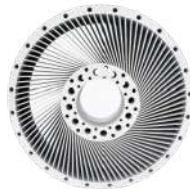
Impeller IN718 \phi 380 x 156 mm